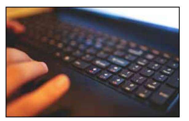
SOFTWARE THAT IS PACP-CERTIFIED MUST PROVIDE, AMONG OTHER THINGS, A MEANS TO BOTH IMPORT AND EXPORT PACP DATA.

TECH TIPS BY NASSCO IS A BI-MONTHLY ARTICLE ON TRENDS, BEST PRACTICES AND INDUSTRY ADVICE FROM NASSCO'S TRENCHLESS TECHNOLOGY MEMBERSHIP PROFESSIONALS.