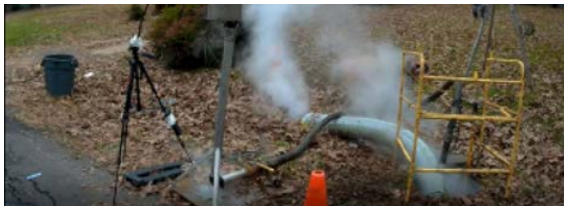
Figure 1. Emissions from an air cure CIPP Project

The GAC method involves a canister of a designed size dependent on the flow and concentration of styrene in the flow. The flow may either be liquid or air. This process can handle effluent from processing the CIPP liner or may also treat the air inside of the refrigerated transport truck prior to opening the truck door at the job site. Once the calculated amount of effluent at the measured styrene concentration has been processed through the GAC canister, the activated carbon must either be regenerated or replaced.