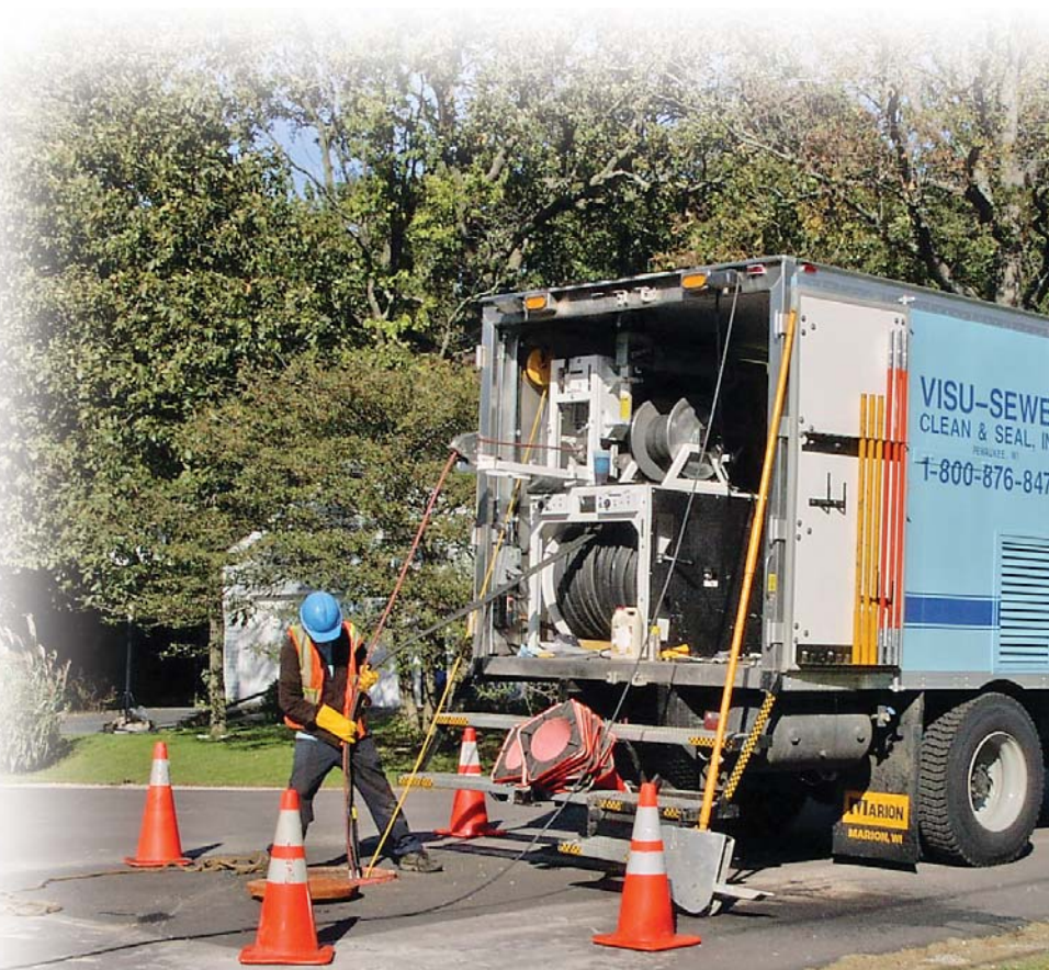
A technician from Visu-Sewer Clean & Seal Inc. starts an inspection of a sewer main in the City of Graettinger, Iowa, as part of the city's program to control inflow and infiltration.