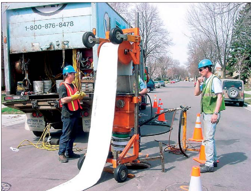
A crew prepares a CIPP lining from National Liner for a trenchless repair job on a main in Graettinger.

The next step is to re-instate the laterals to restore sewer service to prop-