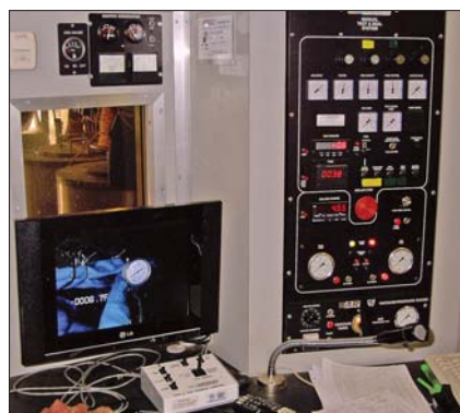
A fully outfitted camera van lets operators control the inspection and record findings.