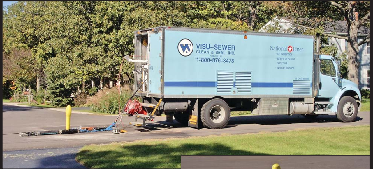
A lateral packer system from Logiball Inc. is deployed on a grouting project. Grouting and CIPP lining were the city's preferred methods of sealing lines against I/I.

Joe Hastreiter is a freelance writer/photographer based in Kewaunee, Wis. ♦